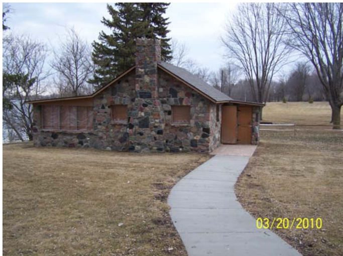
View of Lyon's lodge from the picnic shelter