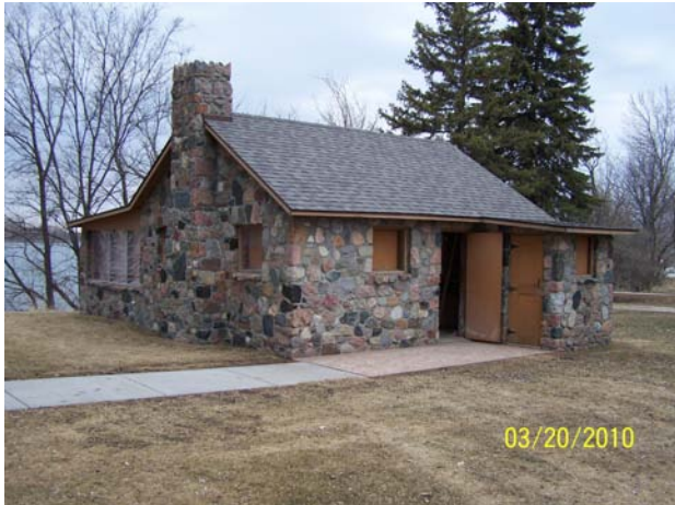
front view of Lyon's lodge

The park encompasses property that was willed to Minnehaha County in 1949 by the estate of Winnow Axtell Lyon. Her will directed that the property be used for public park and recreational purposes. Two stone pillars mark the old driveway entrance to "Lyon Lodge", a stone structure that occupies a prominent site on the bluff above the lake. The pillars and lodge have been renovated to preserve their historical significance.