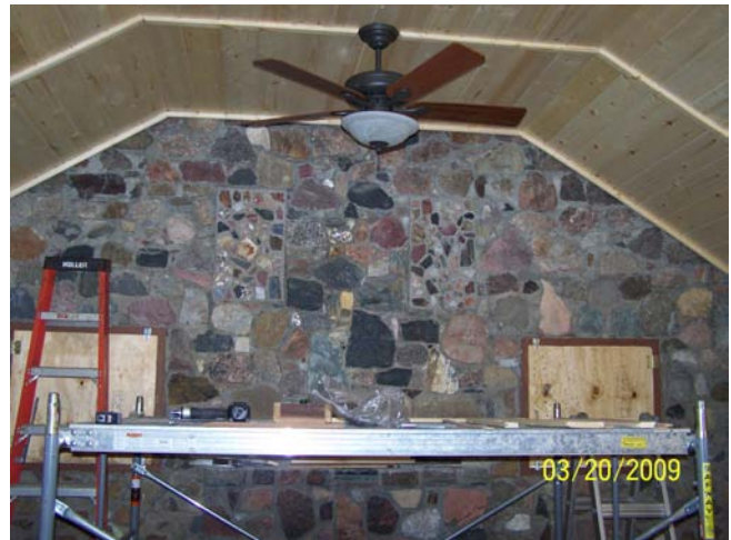
Installation of the new ceiling inside the lodge

Other future renovations that are on the drawing board for Lyon's Lodge include replacing the steps on the west side of the stone cabin that lead down to the lake and a small dock or landing which will allow people to enjoy access to the lake. The major renovations should make Lyon's Lodge desirable for rental use as a location for birthday parties, family reunions and small weddings. The view over the lake is stunning.