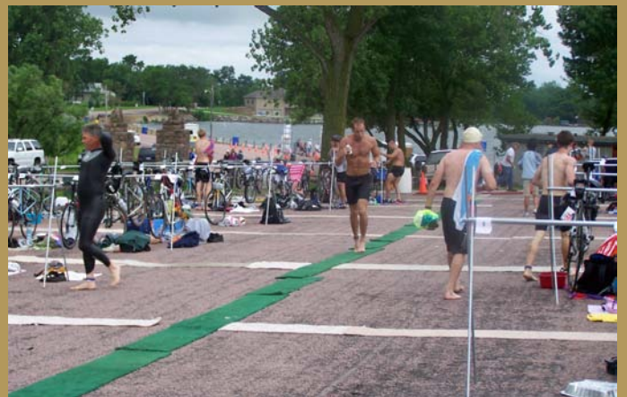
Change over to the bikes. Are these the leaders or the stragglers?