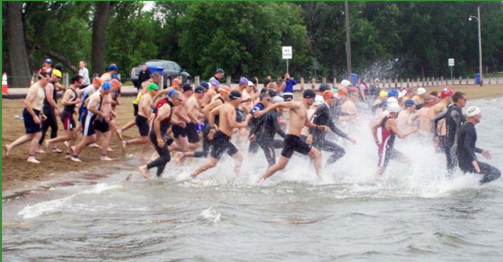
The race starts with a splash. Last one in is a.....