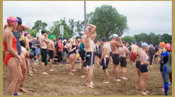
The warm up - of course the wind was blowing!