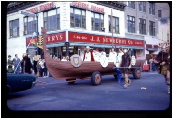
2023.51.208, Vikings Day Parade, 1967

The Siouxland Heritage Museums is dedicated to enhancing the experience of learning in our community, its families and visitors through collections, preservation, and interpretation of history.